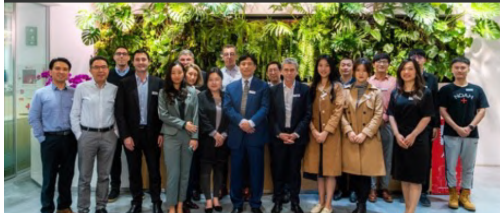
4/22, UTSEUS MOU signing ceremony