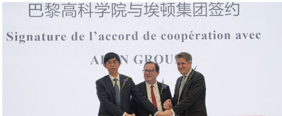
4/7, SPEIT MOU signing ceremony

Aden Group forms partnerships with multiple schools and actively engages with students, offering training and hands-on experience to build positive, long-term community growth.