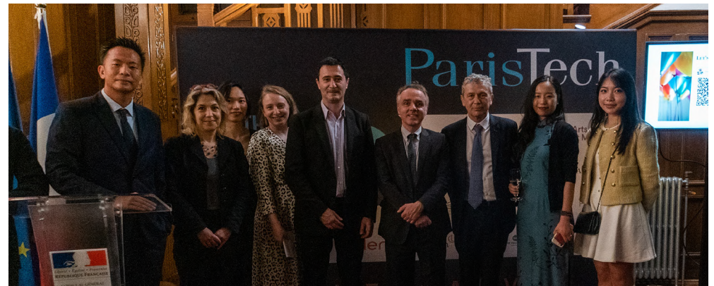
5/20, ParisTech 30-year anniversary