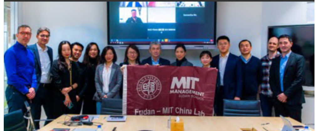
3/5-7/2, Fudan iLab (2 projects)