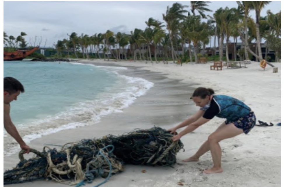
Annual world campaign on World Environment Day on 5th June