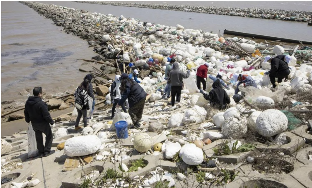
Clean Wetland Project, initiated by SEE Foundation East China Center and Shanghai Chongming Dongtan Birds National Nature Reserve.